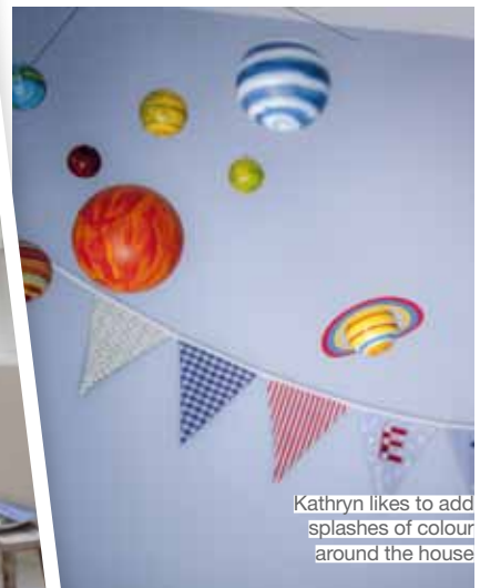
Kathryn likes to add splashes of colour around the house