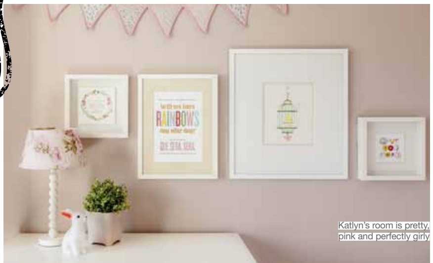
Katlyn's room is pretty, pink and perfectly girly